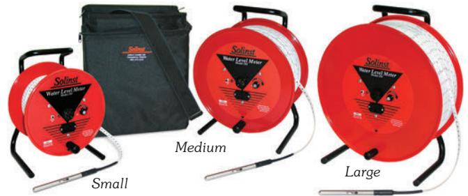
Model 101 Water Level Meter Reels

* Polyethylene tapes are only available in these lengths